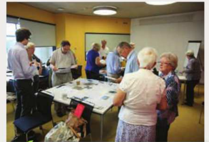
Alvechurch Neighbourhood Plan Committee Workshop

We have also prepared further guidance on neighbourhood planning and the historic environment: www.historicengland.org.uk/advice/planning/plan-making/improve-your-neighbourhood/ .